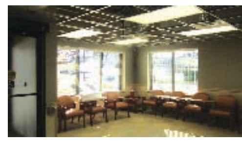
New main lobby.

medical rooms as well. State-of-the-art, energy efficient electrical and HVAC systems have been installed in the new facility. All the lighting was installed with motion detectors mounted on walls and in the ceiling. The furnaces were replaced with 95% energy efficient equipment.